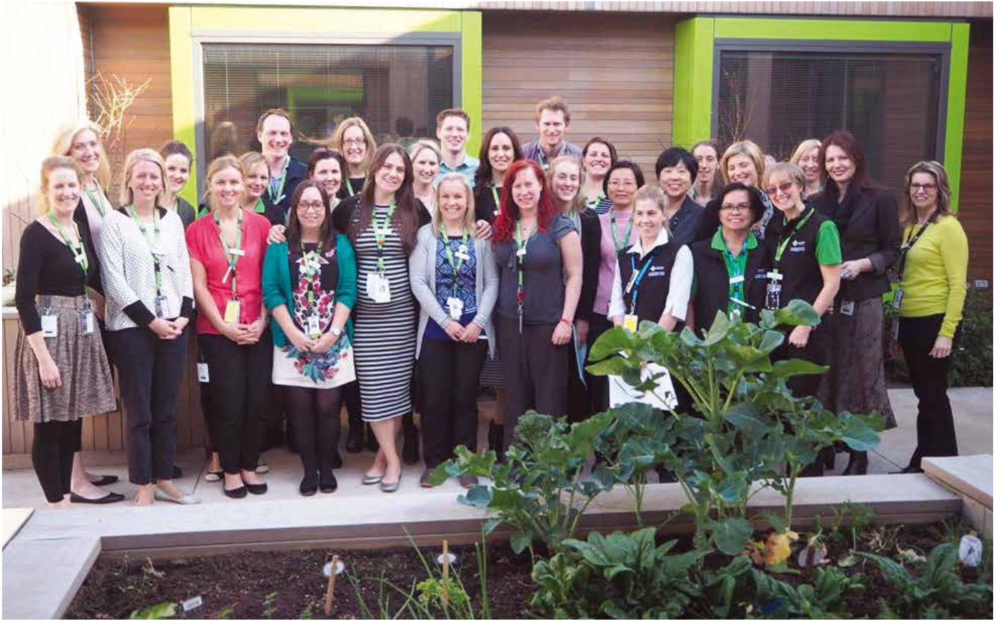
Just some of the more than 100 specialised staff who run the ABI Unit.