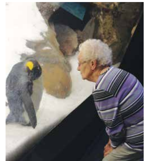
Elderly and active.

“A significant proportion of older adults are leading active, engaged and fulfilled lives.”