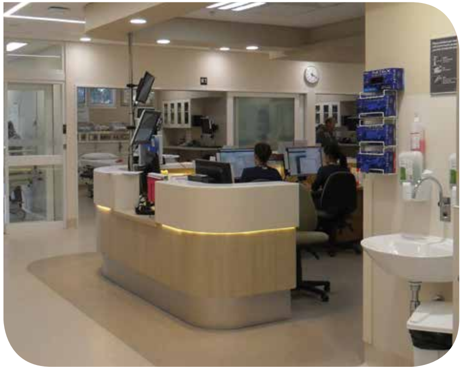
New Sandringham Hospital Emergency Department.

minor, illnesses and injuries are now directed into the urgent care centre to receive care from a general practitioner. This keeps our emergency care teams free to deliver true emergency medicine for patients identified as having more complex needs.