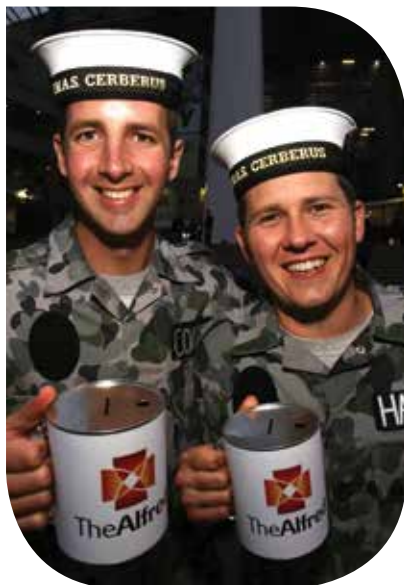
Sailors collecting at the MCG tinshake.