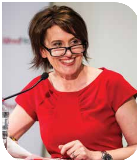
Alfred Health Q&A host Virginia Trioli