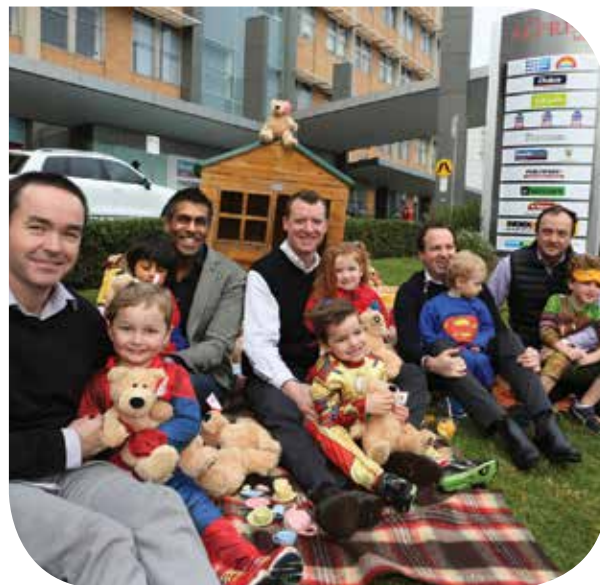
Alfred dads and their kids enjoy a teddy bears picnic.