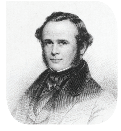
Horace Wells pioneered the use of anaesthesia in dentistry.

Despite its shaky start, nitrous oxide eventually took its place as a mainstay of anaesthesia. General anaesthesia is one of the greatest discoveries in medicine. It provided the base needed for all types of surgery to develop, offering cure and relief of painful conditions for billions of people since the mid-nineteenth century.