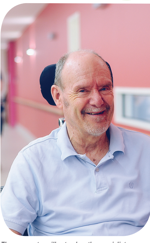
The new centre will extend on the specialist services already available on the Caulfield Hospital site.

The 2014 Australian Transplant Games are set to be held in Melbourne over eight days in September. With more than 21 competitive sports and 10 special events, the 2014 games will be Australia's largest single event promoting organ and tissue donation.