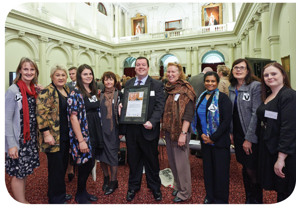
Alfred, Sandringham and RWH HIS team representatives.

The awards are now in their 16th year and are managed by the Public Records Advisory Council and Public Record Office Victoria. The annual awards recognise the importance of preserving the past and the present for future generations.