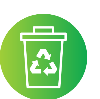
Waste management and recycling