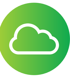
Energy efficiency and emissions