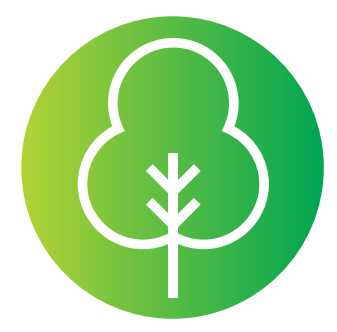
Healthy habitats and environments

We will achieve this vision though building leadership, partnerships and resilience across the following eight sustainability themes: