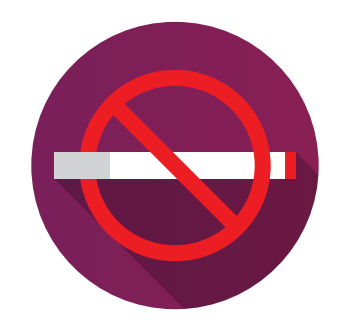
Reducing the harm from tobacco

In developing the strategy, five key priority areas have been identified for action: