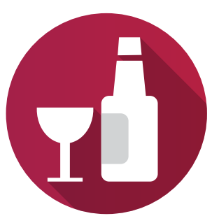
Reducing the harm from alcohol